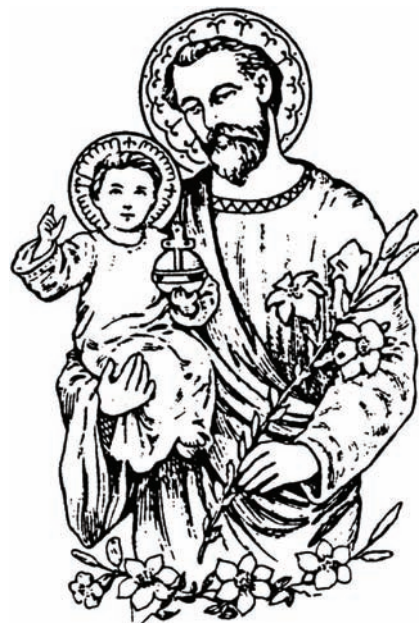
Feast of St. Joseph